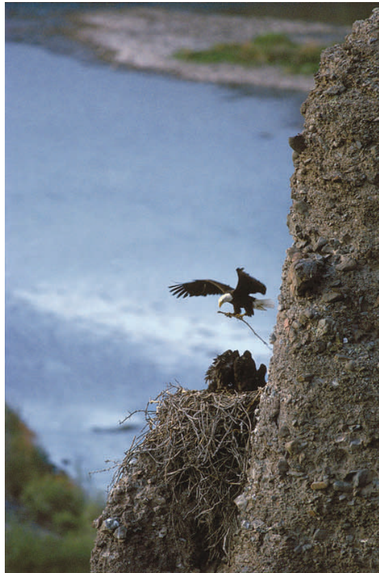
Desert Nesting Bald Eagle